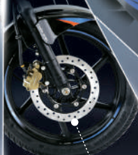
260MM FRONT DISC