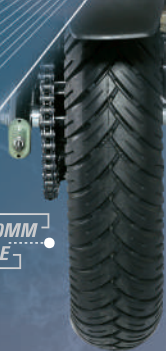
WIDE 120MM REAR TYRE