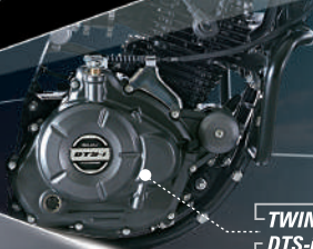
TWIN SPARK DTS-i ENGINE