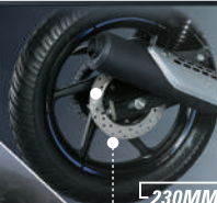
230MM REAR DISC